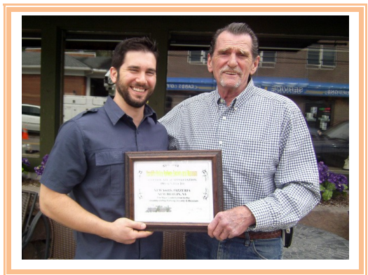
Rosario Baio NY Pizzeria, 7 South Main Street, New Berlin, NY